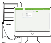
ZKTime Net 3.0