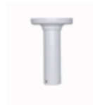
PB02 Pendant Mount